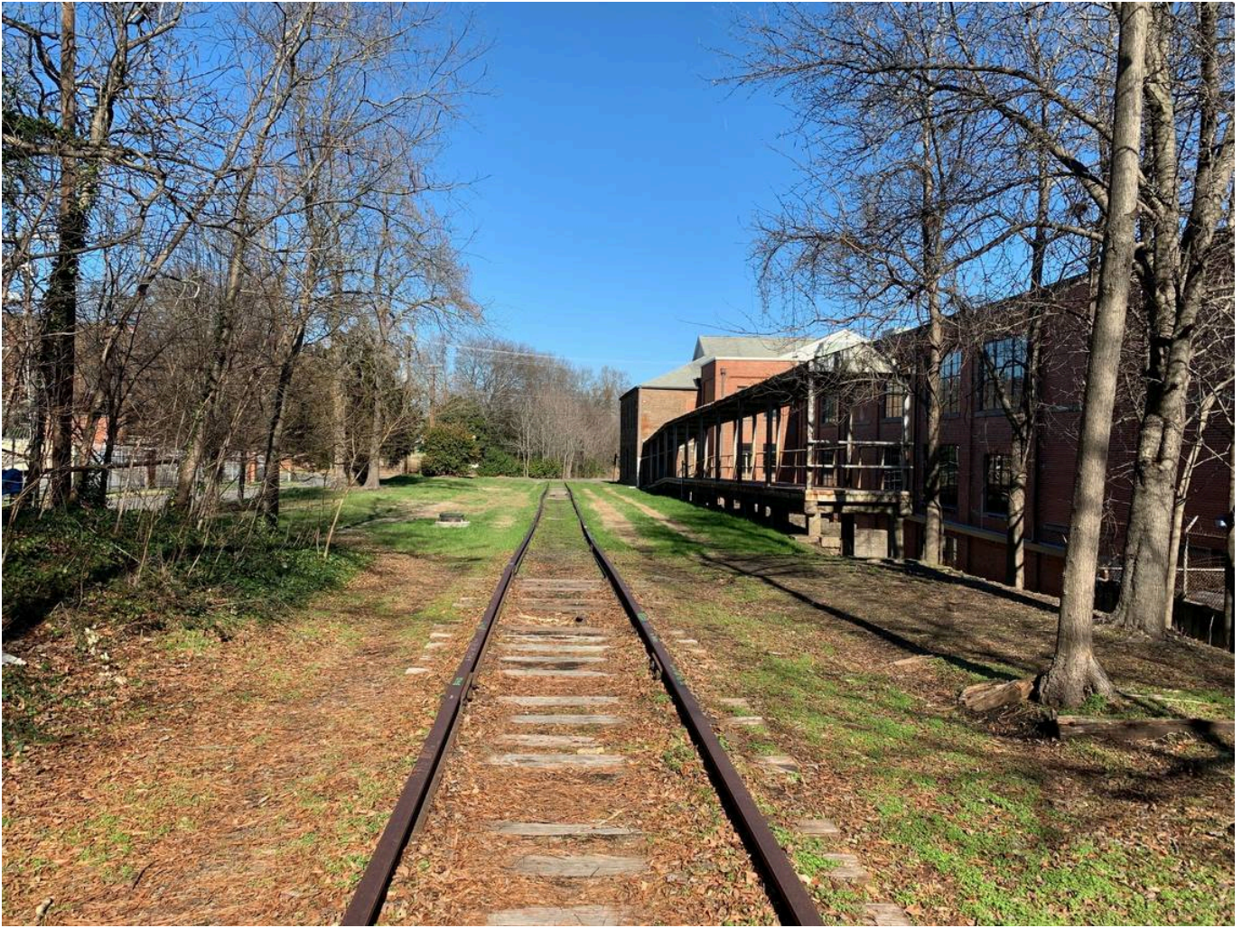
A section of the old Durham Belt Line, near Fuller Street in downtown Durham. The old freight rail line is being turned into the Durham Rail Trail.